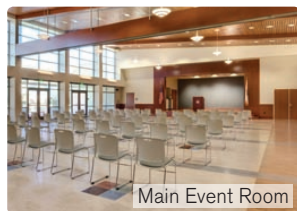
Main Event Room

For more details, such as room availability and pricing, visit the City's website at www.lawndalecity.org , and go to Government, Departments, Community Services, Facilities Rental and click on the Facility Rental and Deposit Fee Schedule to get all of the room and pricing details. After visiting the website, if you still have questions, please contact the Community Services Department.