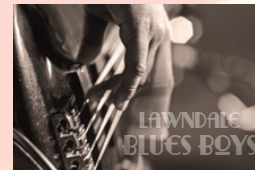
Lawndale Blues Boys - 1:30 p.m.