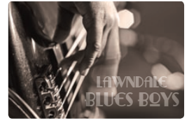
Lawndale Blues Boys - 1:30 p.m.