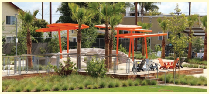
Larry R. Rudolph Park