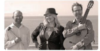
Ellis - 11:00 a.m.