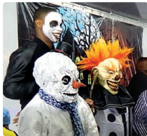
Halloween Ghouls and Goblins