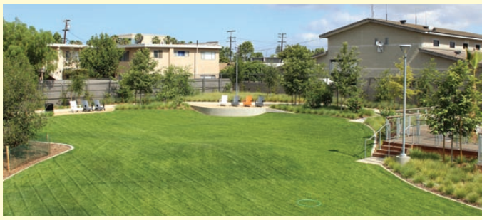
Larry R. Rudolph Park