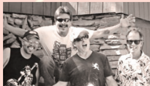
Awesome Blue - 2:45 p.m.

Si le gustaría estar en la Lista para recibir tarjetas postales del Festival de Blues y Jazz de Lawndale para saber de futuros eventos de festivales de música, por favor mande un correo con su información, nombre, dirección, ciudad y código postal, a mestes@lawndalecity.org y escriba Music Festival Mailing List en la línea de asunto (subject line).