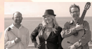
Ellis - 11:00 a.m.