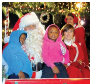
Santa's Sleigh Looking Good

Activities: Haunted House, Costume Contests, Live Stage Entertainment, Games. All activities are free! Delicious food available for purchase.