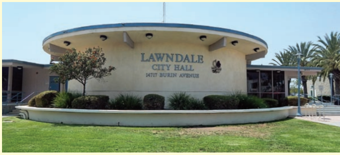
Lawndale City Hall

Fall 2016 • Vol. 22 • No 3 • www.lawndalecity.org • (310) 973-3200