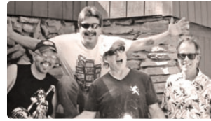
Awesome Blue - 2:45 p.m.

If you would like to be on the Lawndale Blues and Jazz Music Festival Post Card Mailing List to learn about future music festival events, please send an email with complete mailing address information such as name, address, city and zip to mestes@lawndalecity.org with Music Festival Mailing List in the subject line.