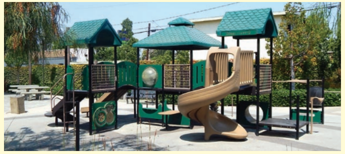
Charles B. Hopper Park