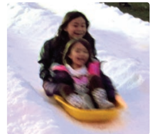
Snow Sled Run for Children

Activities: Visits and Photo Ops with Santa Claus, Live Stage Entertainment, Winter Activities. All activities are free! Delicious food available for purchase. Don't forget your camera to capture those memorable moments!