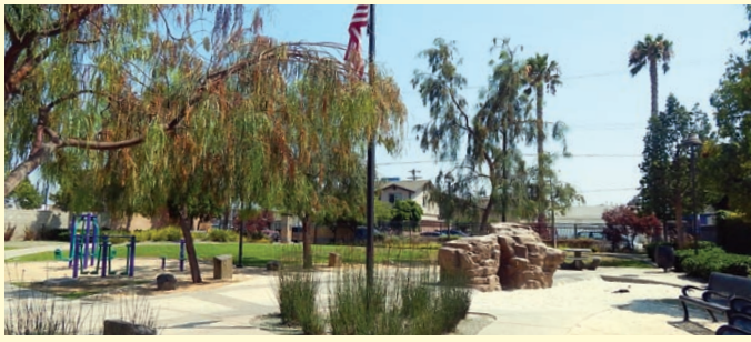
Charles B. Hopper Park