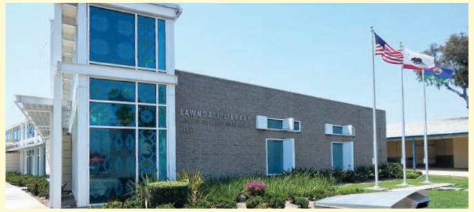
Los Angeles County, Lawndale Library